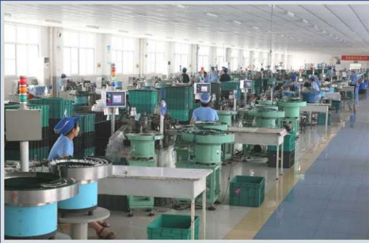
Pumps' Assembling works