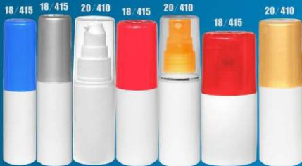
18 / 415 18 / 415 20 / 410 18 / 415 20 / 410 18 / 415 20 / 410 PB-16 15ml PB-17 25ml PB-18 30ml PB-19 40ml PB-19A 40ml PB-19B 40ml PB-20 50ml