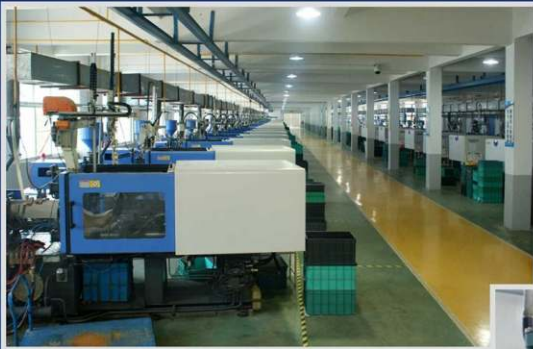
More than 500 plastic injection machines for production