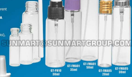
GT-PH10 30ml GT-FMA01 35ml GT-FMA01 50ml GT-FMA05 20ml GT-FMA05 30ml

For the glass tubes with spray pumps, we can produce them for different capacities and necks as per your requirements. Perfume Samplers with Plastic Sticks PA-06 with a hook and PA-06A without a hook Glass Tubes: 1.0ml, 1.5ml, 2ml, 4ml PA-05 Glass Tube 4ml, 5ml with PP dustcap with FMA-01 12/410 PA-04 Glass Tube 4ml, 5ml with PP dustcap with FMA-02 12/410 (metal sheathed closure+actuator) GTC (glass tubes in crimp-on necks), GT (glass tubes in screw-on necks) amber, clear and frosted glass tubes in different capacities from 8ml, 10ml, 15ml, 20ml, 30ml, ... with different pumps