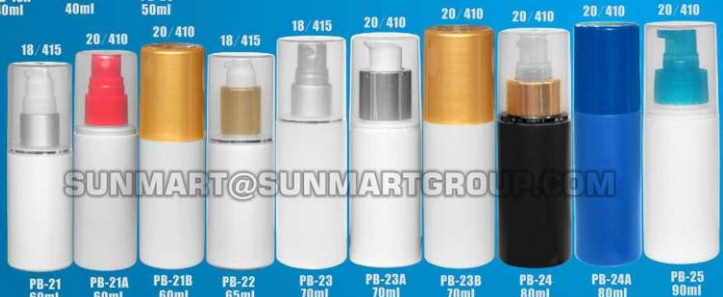
18 / 415 20 / 410 20 / 410 18 / 415 18 / 415 20 / 410 20 / 410 20 / 410 20 / 410 20 / 410 PB-21 60ml PB-21A 60ml PB-21B 60ml PB-22 65ml PB-23 70ml PB-23A 70ml PB-23B 70ml PB-24 80ml PB-24A 80ml PB-25 90ml