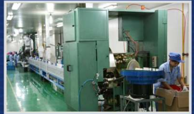
Automatic aluminium bottle machines