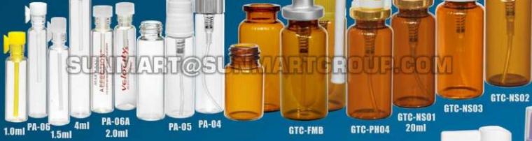
1.0ml PA-06 1.5ml 4ml PA-06A 2.0ml PA-05 PA-04 GTC-FMB GTC-PH04 GTC-NS01 20ml GTC-NS03 GTC-NS02