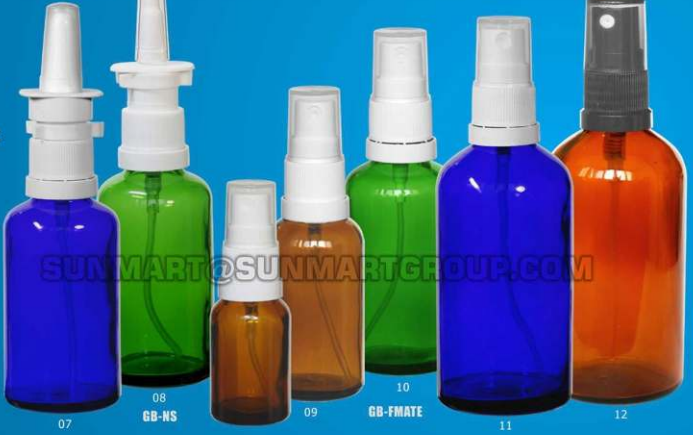
07 08 GB-NS 09 GB-FMATE 10 11 12

Amber, Blue, Green Glass bottles with Caps, Spray Pumps, Droppers - the amber, blue, green glass bottles with different capacities and necks (crimp-on and screw-on versions) for your options - GBC-NS (with metal ferrules) and GBC-NSC (with plastic ferrules) amber glass bottles neck: in crimp-on with nasal sprayers - " GB-NS " amber, blue, green glass bottles neck: DIN18 with nasal sprayers in tamper evident closure 18/410 - " GB-FMATE " amber, blue, green glass bottles neck: DIN18 with fine mist sprayers in tamper evident closure 18/410