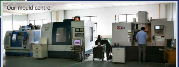
Our mould centre