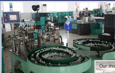
All spray pumps are tested by vacuum test machines by 100% during production