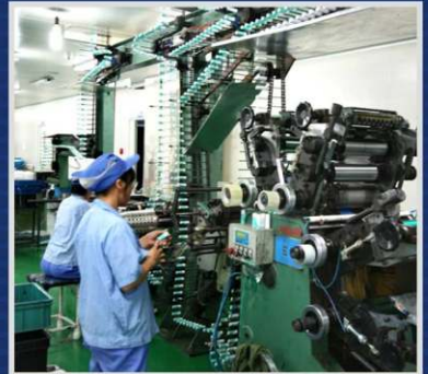
Automatic printer for aluminium bottles