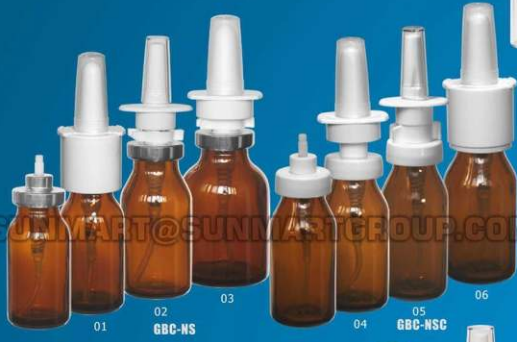
01 02 03 GBC-NS 04 05 06 GBC-NSC

Amber, Blue, Green Glass bottles with Caps, Spray Pumps, Droppers - the amber, blue, green glass bottles with different capacities and necks (crimp-on and screw-on versions) for your options - GBC-NS (with metal ferrules) and GBC-NSC (with plastic ferrules) amber glass bottles neck: in crimp-on with nasal sprayers - " GB-NS " amber, blue, green glass bottles neck: DIN18 with nasal sprayers in tamper evident closure 18/410 - " GB-FMATE " amber, blue, green glass bottles neck: DIN18 with fine mist sprayers in tamper evident closure 18/410