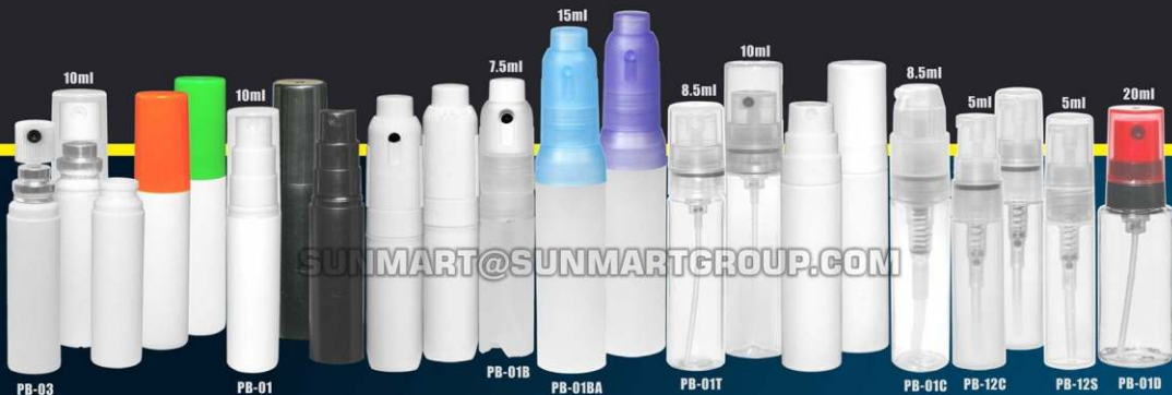
PB-03 PB-01 PB-01B PB-01BA PB-01T PB-01C PB-12C PB-12S PB-01D